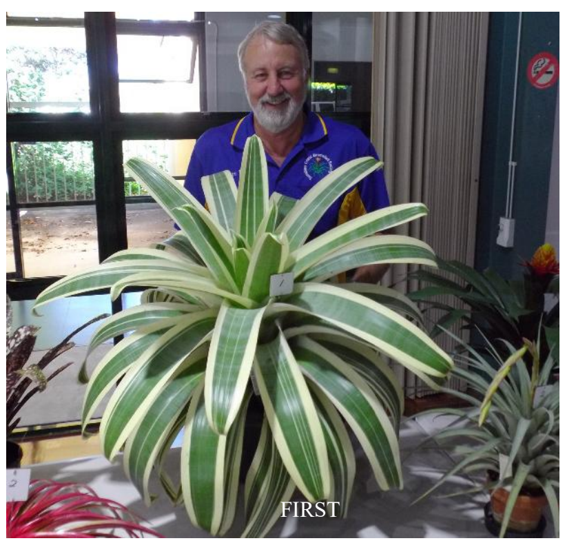
Alcantarea White Star