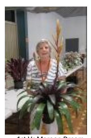
1st Vr.Maroon Dream True Grant