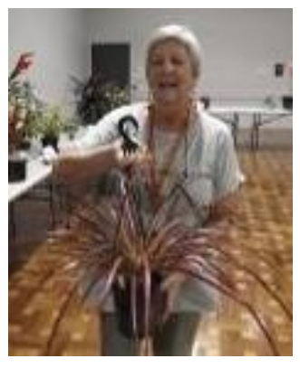
2nd x Sincoregelia 'Ecstasy' True Grant