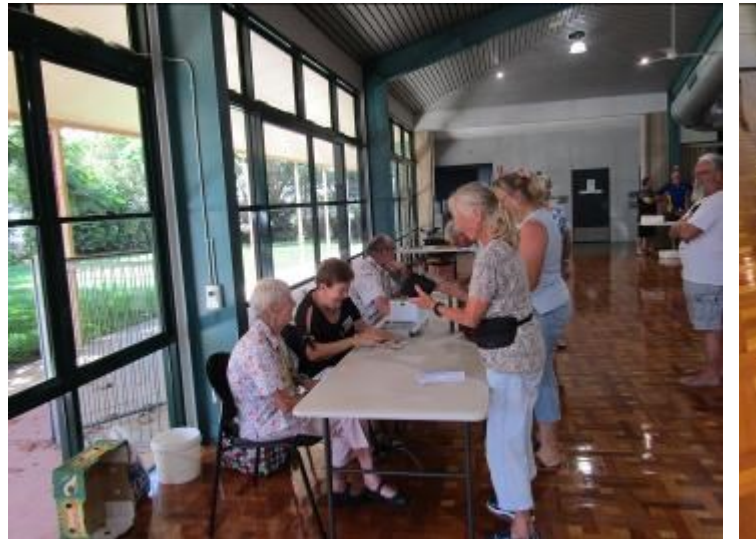
Plant Raffle Tickets on sale