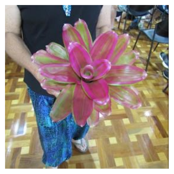
2nd Sue Pedler - Neo. Loucana