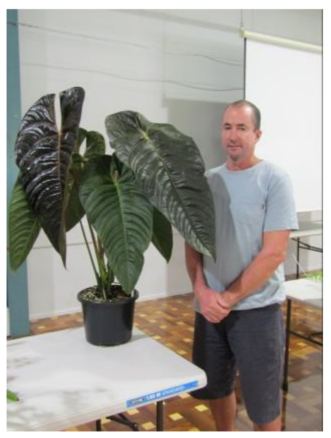
2nd Bruce Dunstan (7 Votes) Anthurium Red Beauty x veitchii