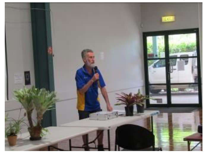
Presidents address at start of meeting