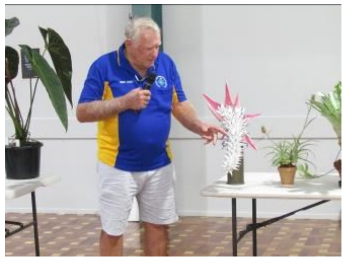
Show and Tell by Doug Cross