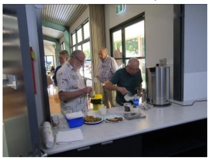
Its help your self at the at morning tea break