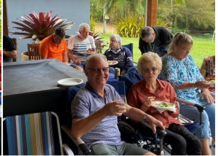
Lunch time treat courtesy of the club