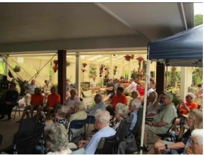
Meeting in progress