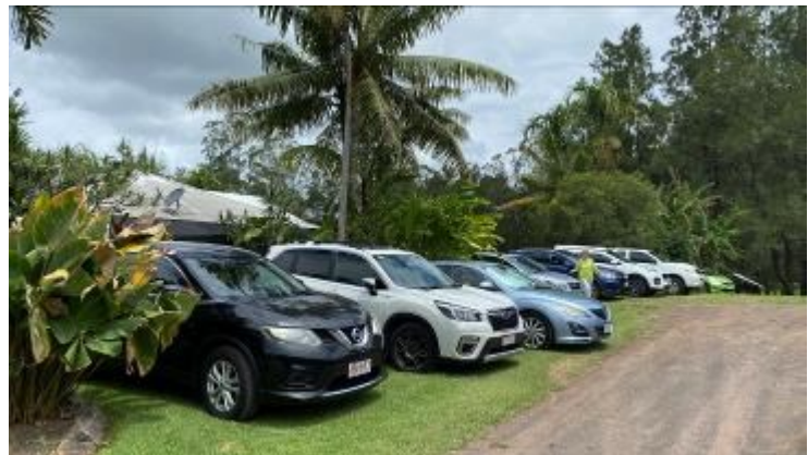
Ample parking space for members attending