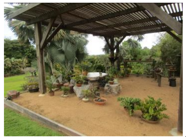
Spectacular garden features