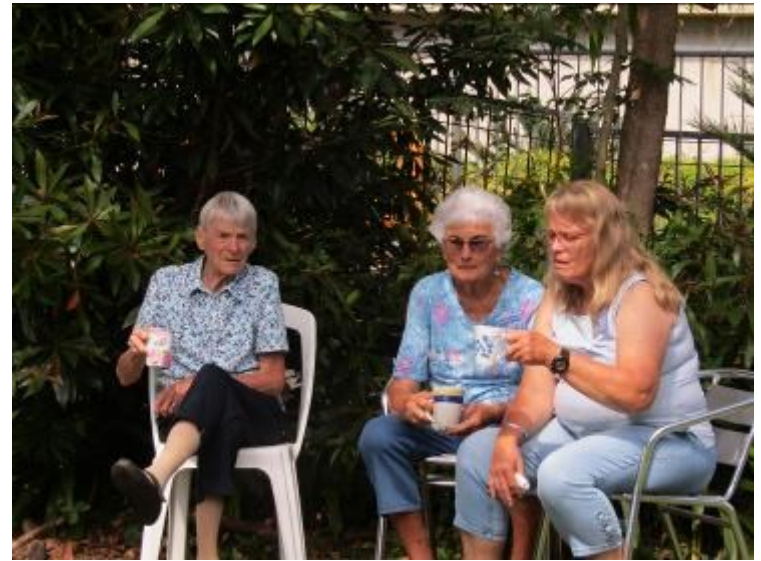
Coffee/Tea break prior to Monster Raffle