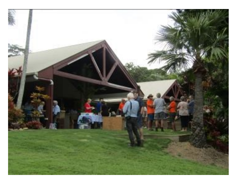
Meeting in progress