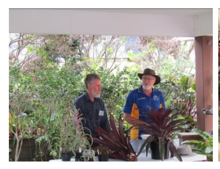
Drawing of lucky attendance plant