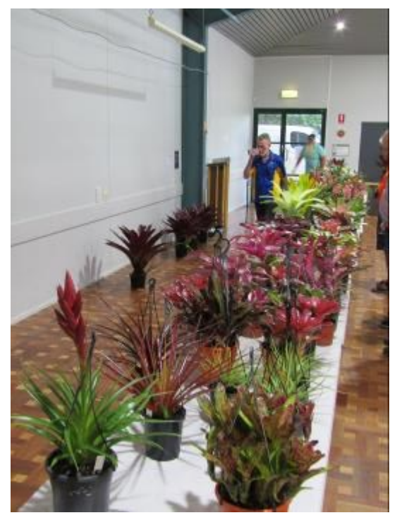
Monster raffle plants on display