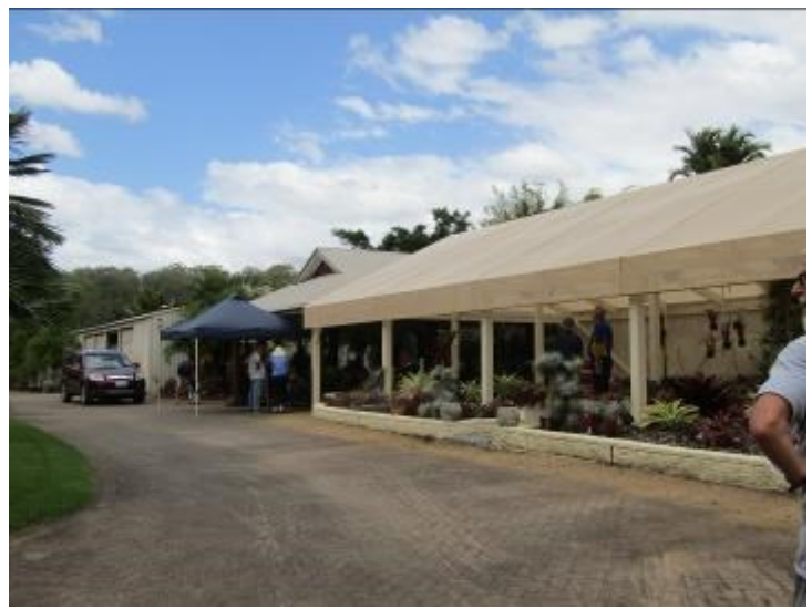
Refurbished shade structure