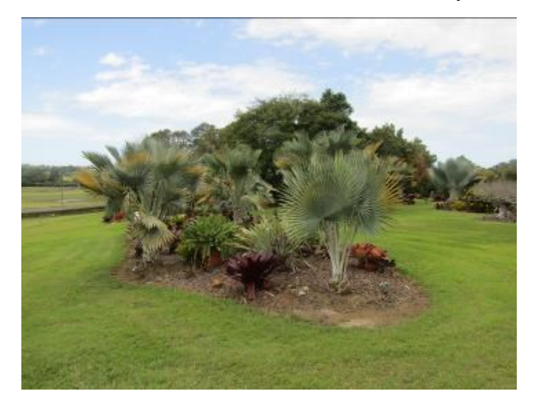
A Gardeners Delight