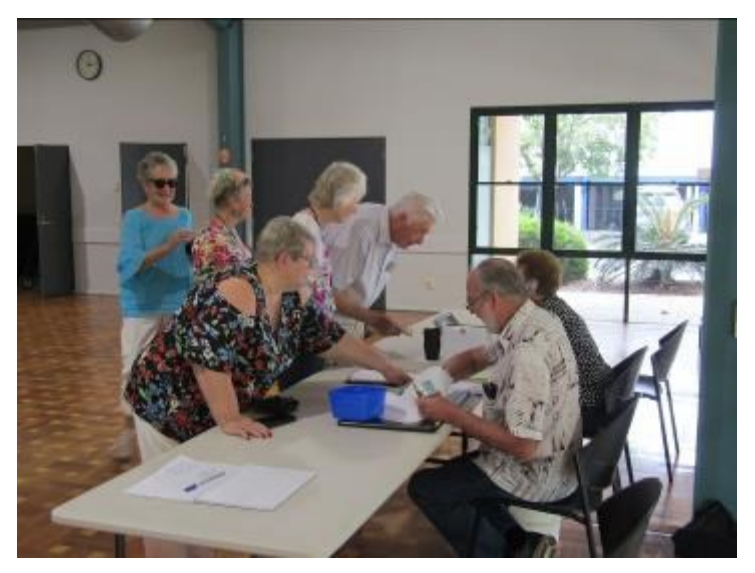
Membership payment and Raffle ticket sales