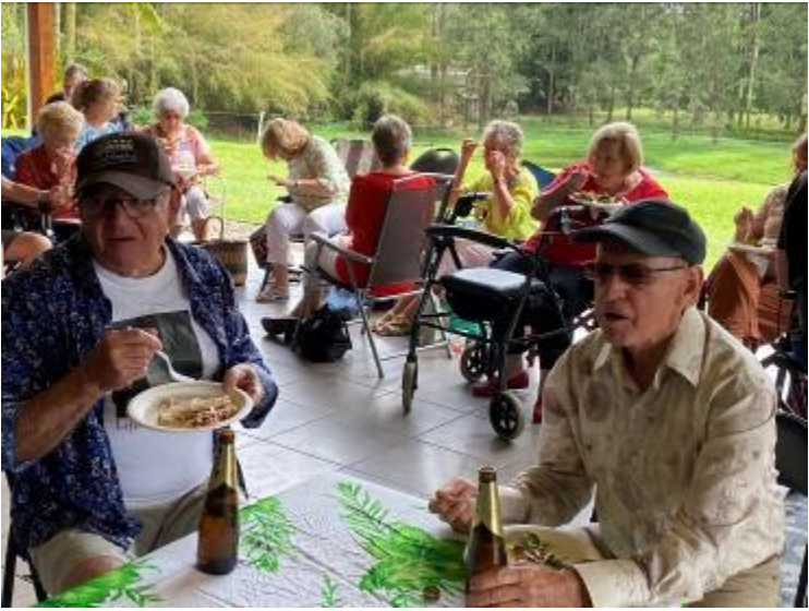
Lunch time treat courtesy of the club