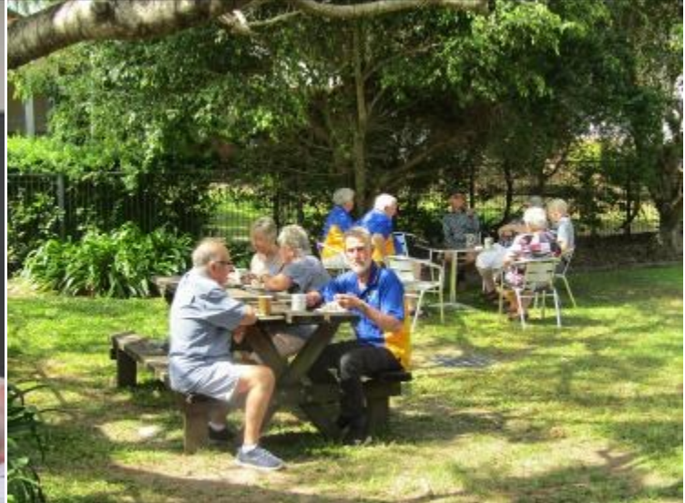
Coffee/Tea break prior to Monster Raffle