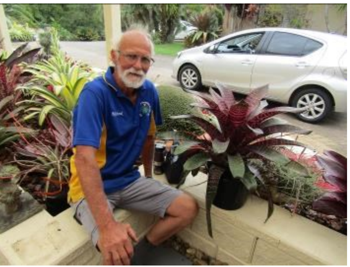
Guess who the lucky winner is