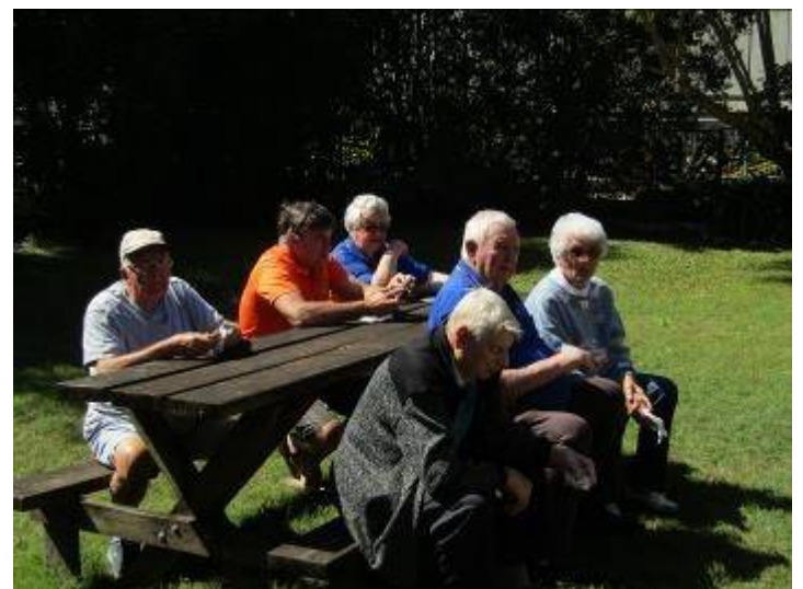
While seated relaxing in the sunshine