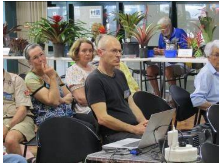
Faces in the crowd