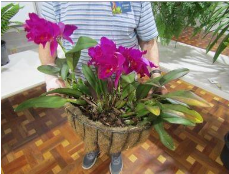
Above 2nd Frank Tucker (8 Votes) Potinara Orchid - Jungle Fire Koah Siuw