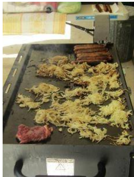
Last of the sausages, bring in your own steak and it's cook on the spot