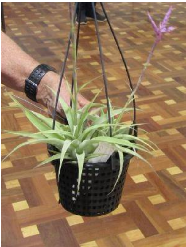
2nd (5 Votes) Greg Jones Till. cacticola