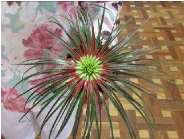
Equal 2nd Sue Murray - 6 Votes Sincoraea andarii