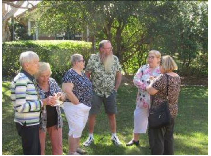
Chit Chat amongst members