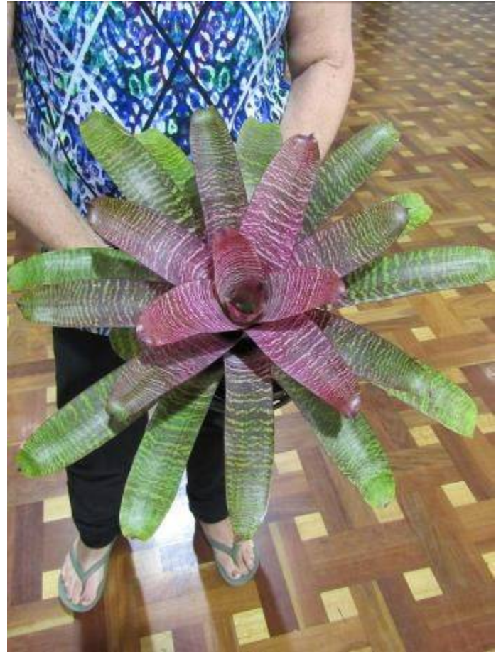
2nd Sue Pedler (10 Votes) Vr. Crimson Lace