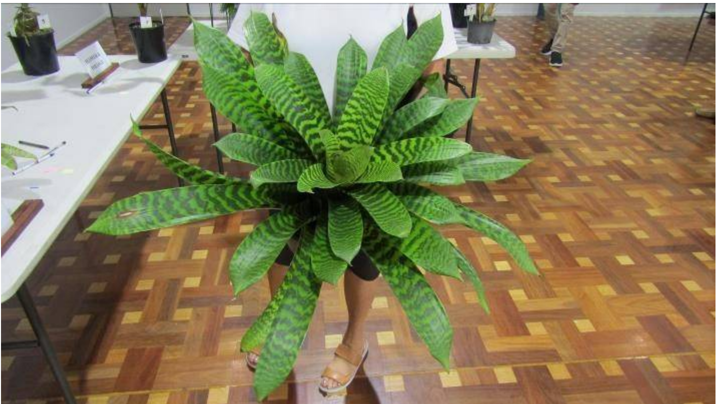
3rd Cheryl Basic (6 Votes) Vr. heiroglyphica