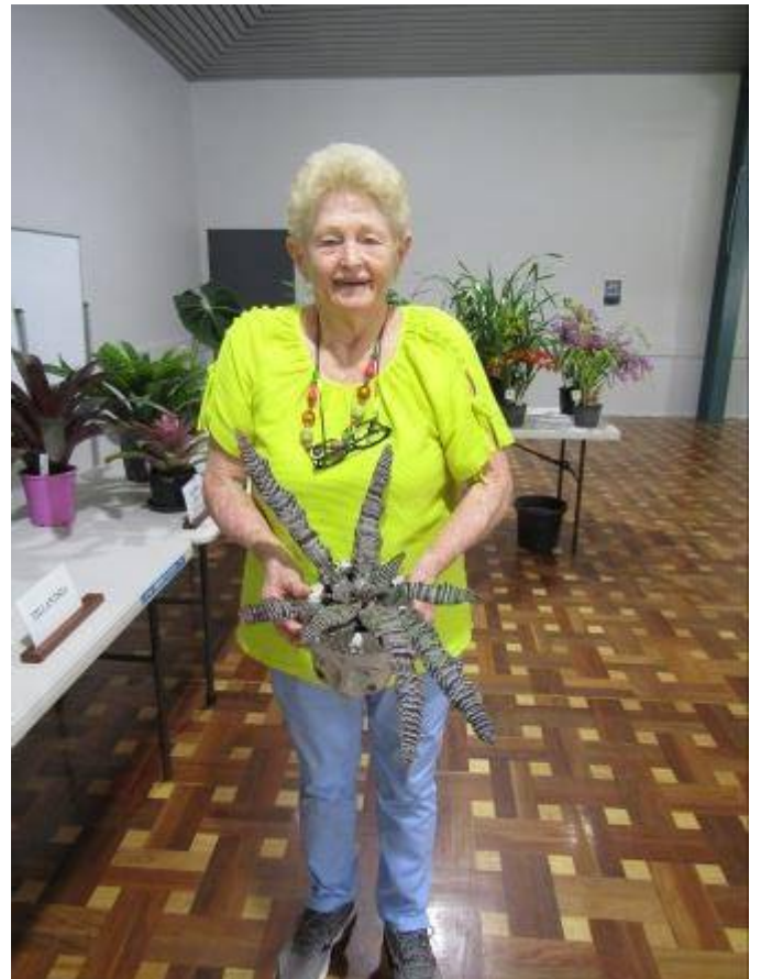
3rd Mary DeHayr (5 Votes) Cryptanthus