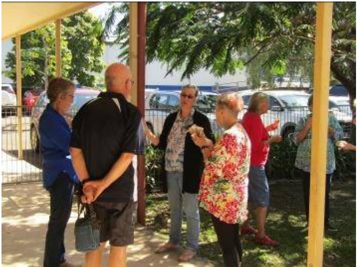
Always something to talk about prior to start of meeting