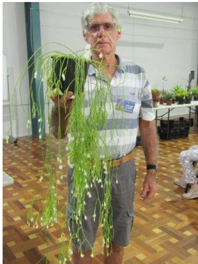
Above - 2nd Stuart Cheyne 6 Votes Rhipsalis capilliformis