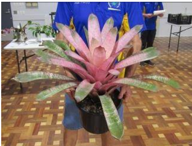
2nd Stan Walkley (7 Votes) Vr. Pink Cloud