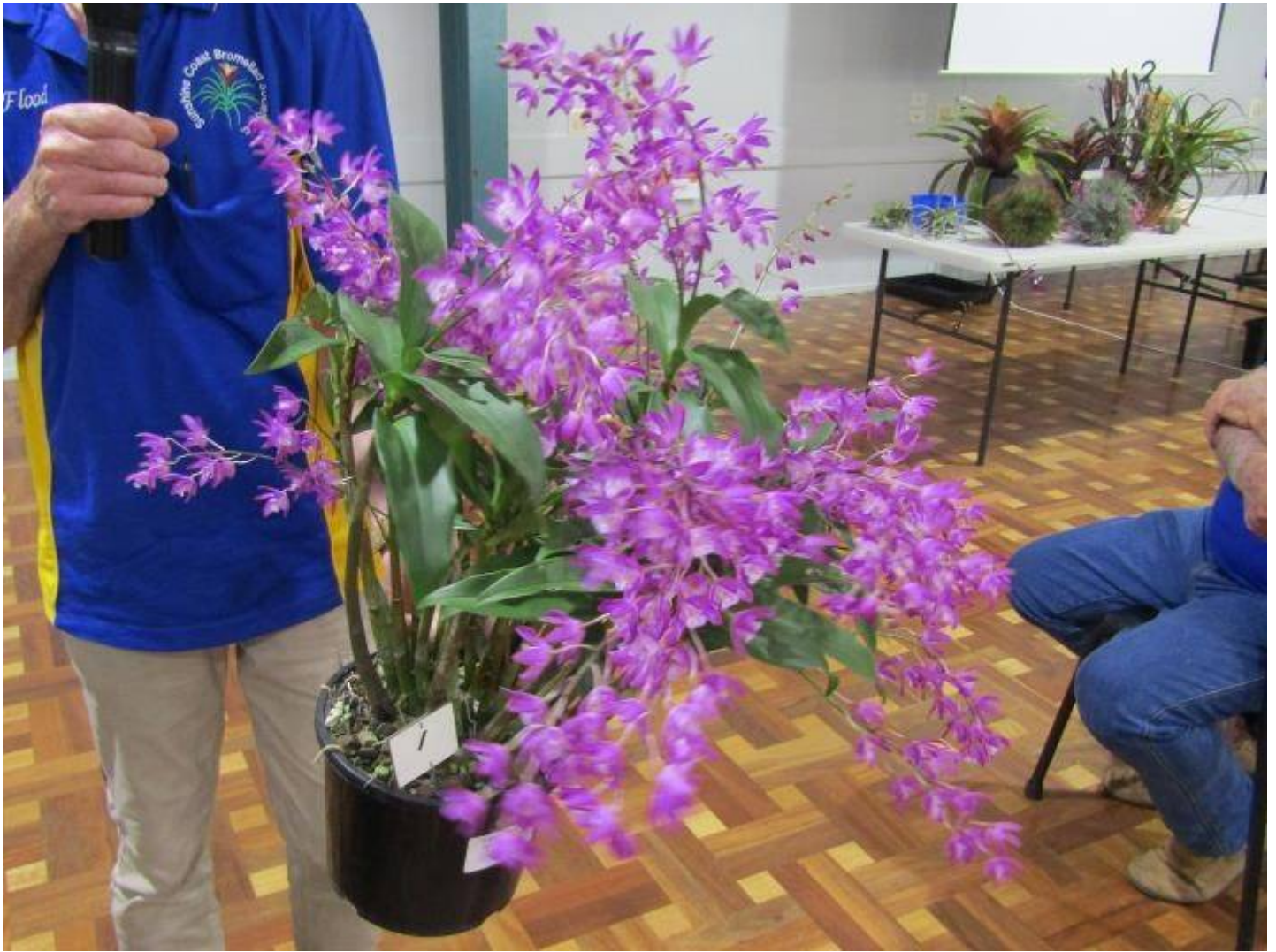
1st Steve Flood (14 Votes) Dendrobium kingianum