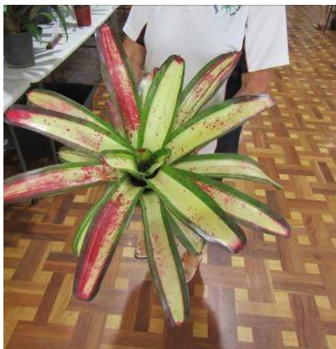
2nd Cheryl Basic (10 Votes) Neo. Big Bopper