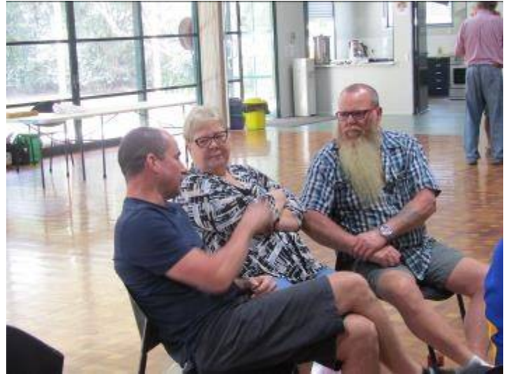
Prior meeting conversations