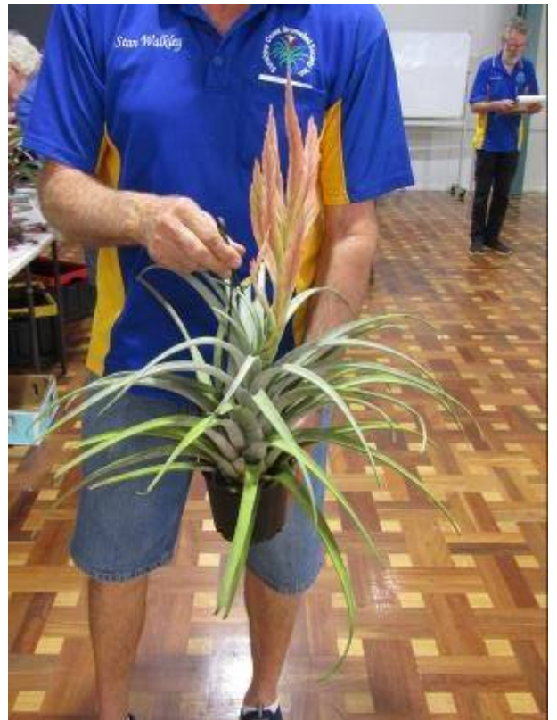
3rd (3 Votes) Stan Walkley Till. zacapensis