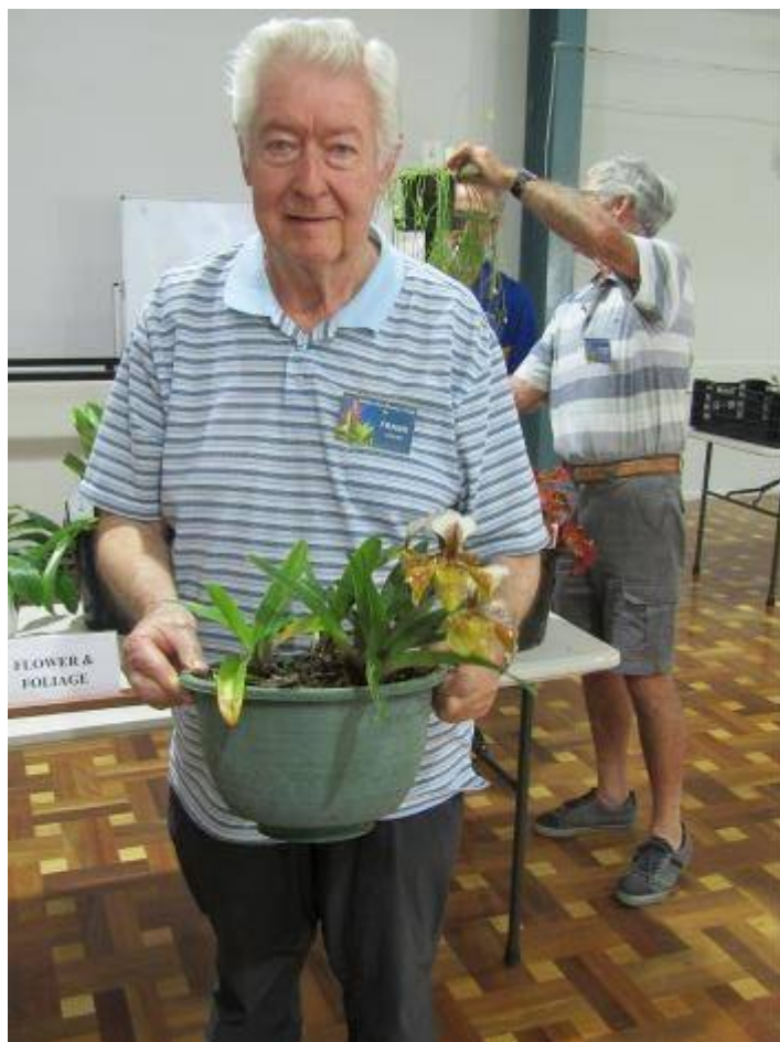
Left - 1st Frank Tucker 14 Votes Orchid - Paphiopedalum Villosum