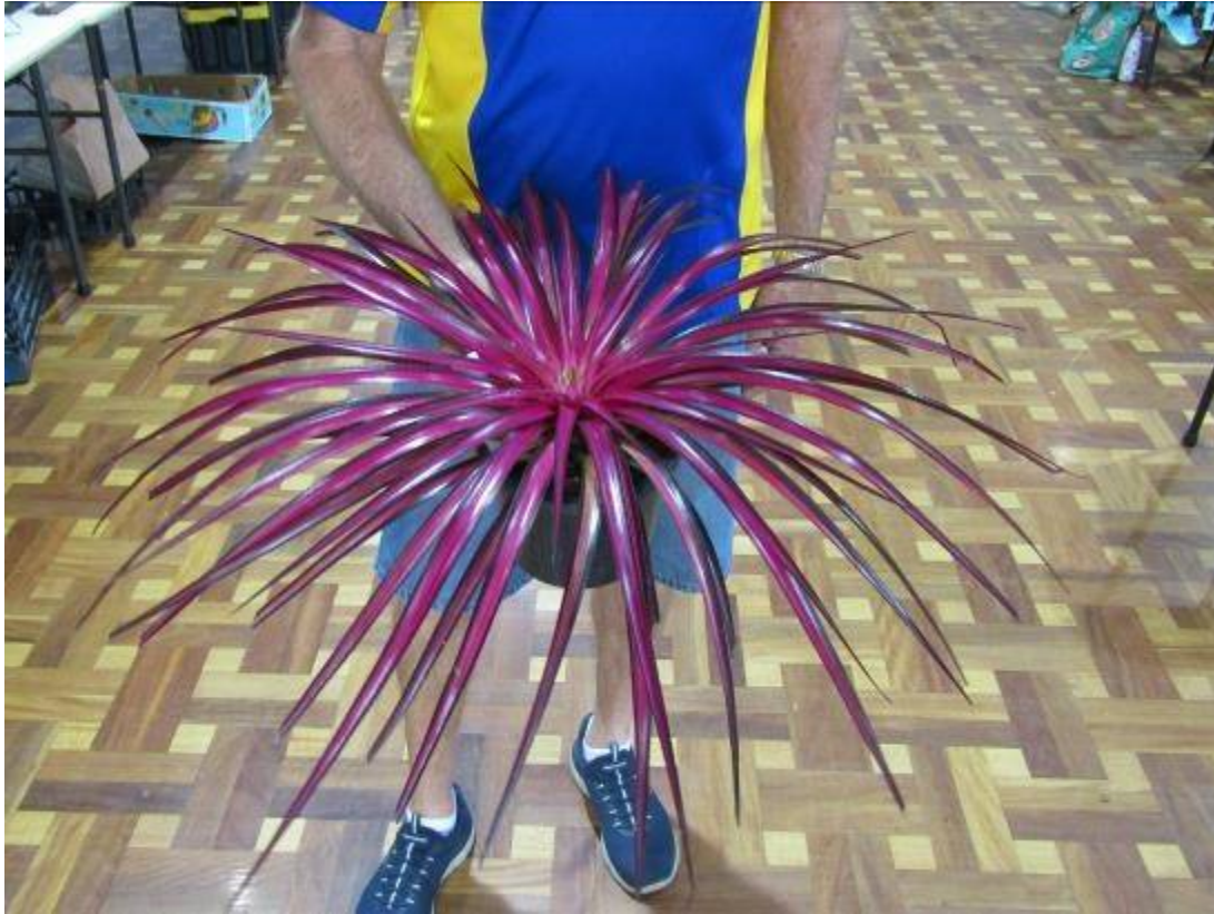
Stan Walkley 1st - 16 Votes Sincoregelia Estacy