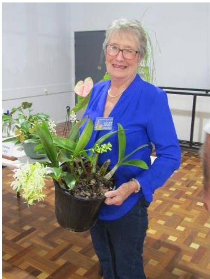
Left - 3rd Juliet Robinson 5 Votes Orchid - Dendrobium Speciosum