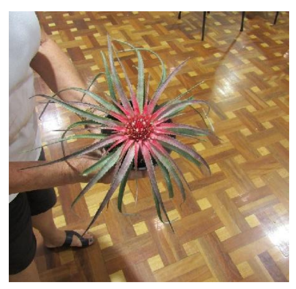
3rd Cheryl Basic - Sincoraea