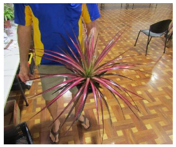
2nd Stan Walkley - Sincoregelia Estacy