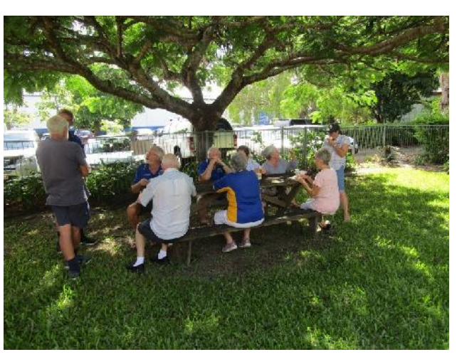
Afternoon tea break under the Poinciana tree