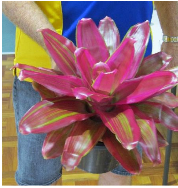
Equal 2nd Stan Walkley - Loucana