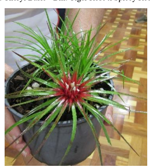
2nd Cheryl Basic—Sincoraea ophiuirieoles