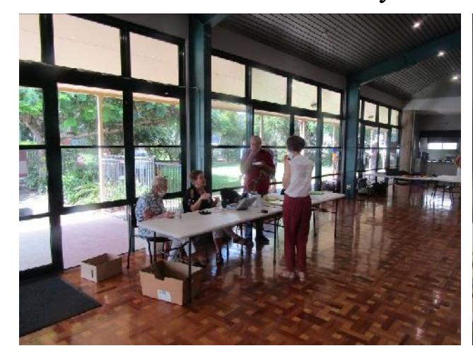
Admin. desk sign in and raffle ticket sales