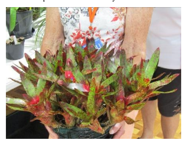
Equal 2nd—Stuart & Jill Cheyne - Hearts Blood