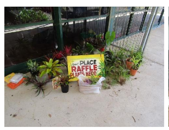
Raffle plants on display