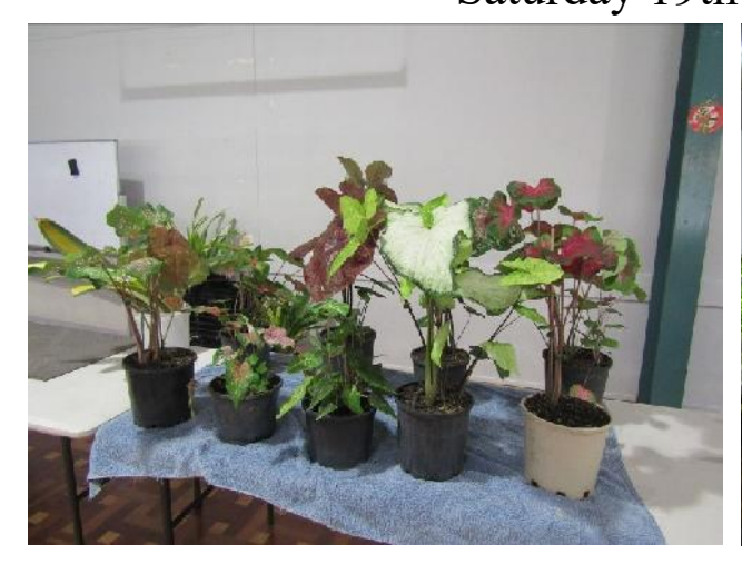
Foliage & Flowers for discussion