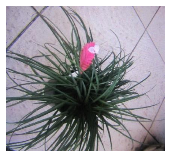
2nd Stan Walkley - Wallissia lindenii