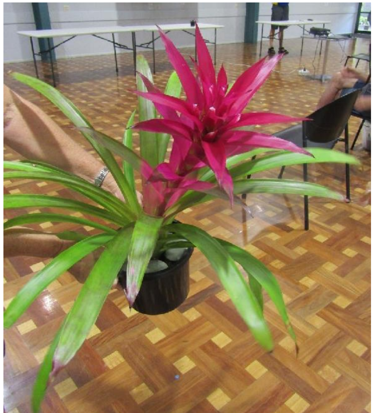
PATTERN LEAF VRIESIA