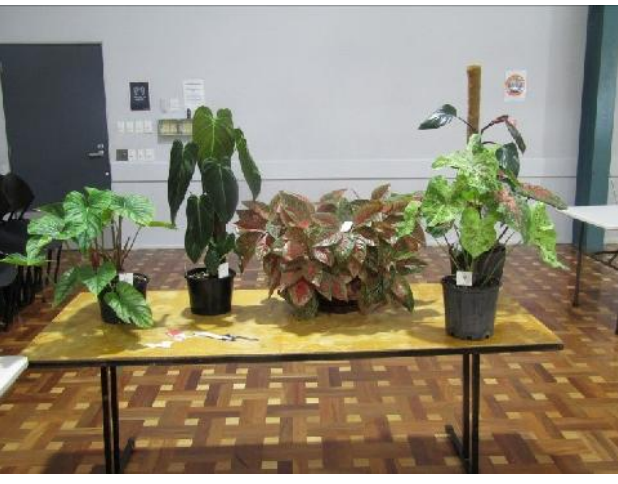
Popular Choice Foliage and Flowers