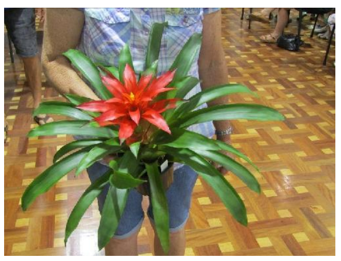
3rd Sue Pedler-Guz. noid