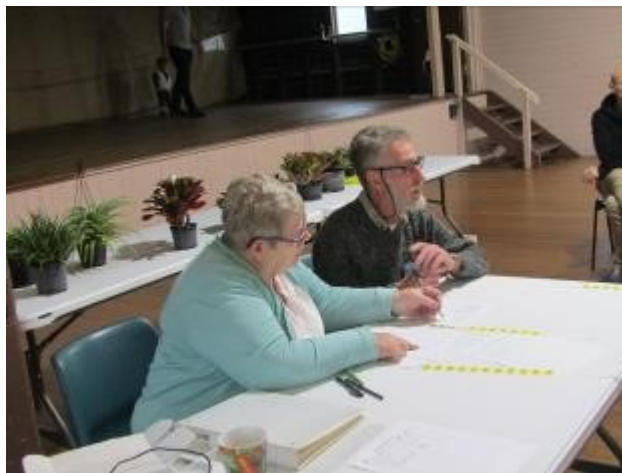
Score table for Neo. & Cryp. Competition