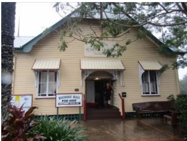
Hall entrance for club meeting