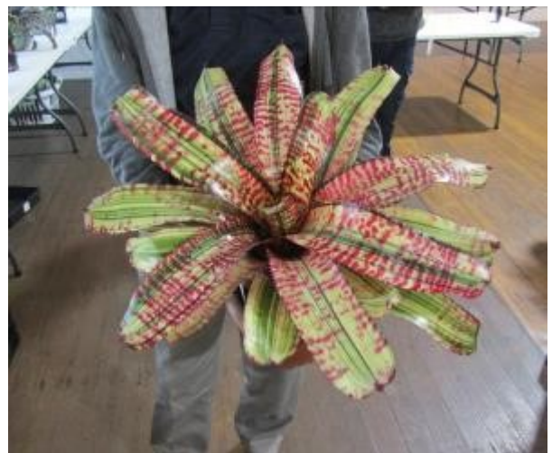
2nd Goff Loughran - Red Opal