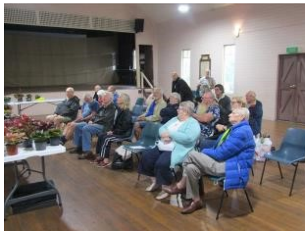
Small in number but big in enthusiasm