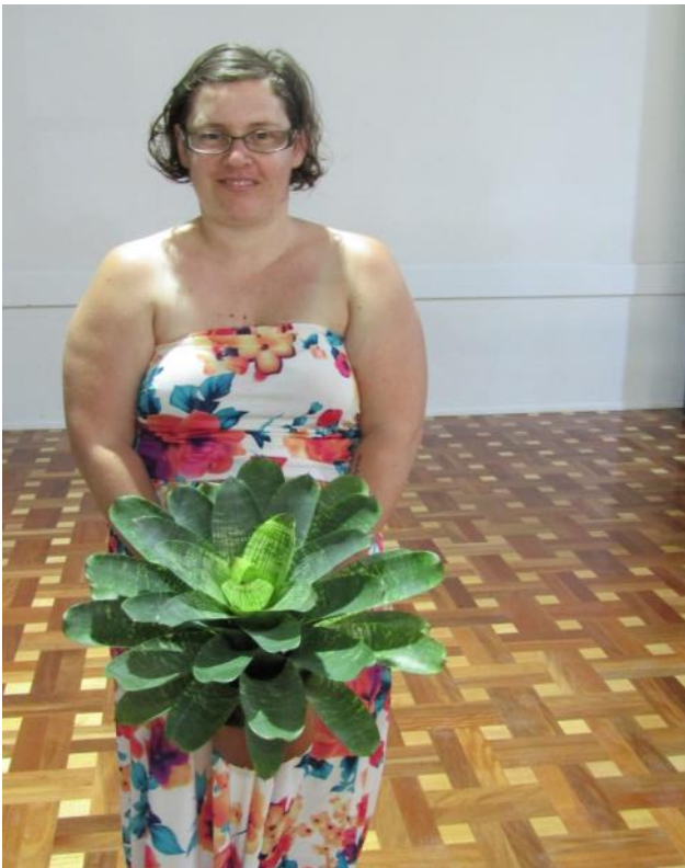
Second Megan McKerrell Vr. Wyee Point x Paho Beauty 4 Votes