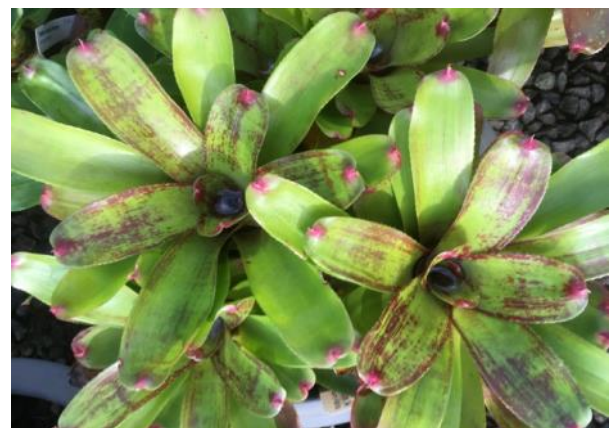
Neo. Rise and Shine