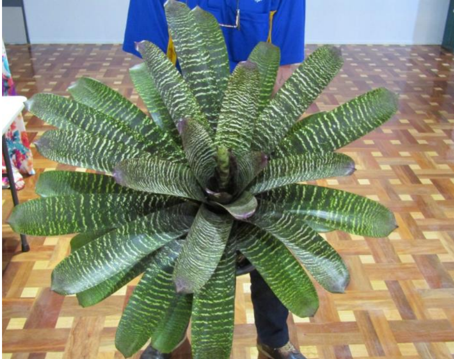
First Steve Flood - El Zoro - 24 Votes