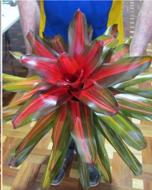
1st Steve Flood Orange Glow - 13 Votes