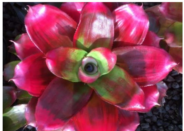
Neo. Sweet Reward