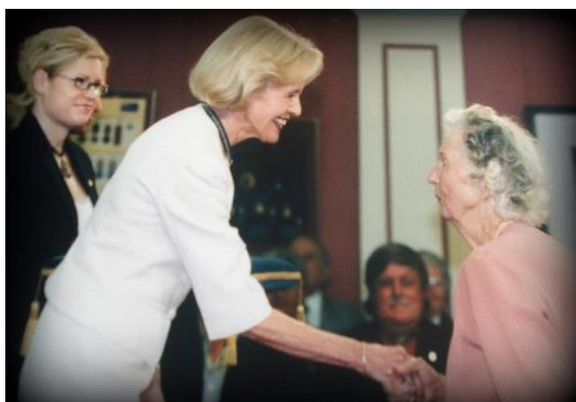
Grace being presented with her OAM in 2004

Grace passed away peacefully on Sunday 20th October 2019