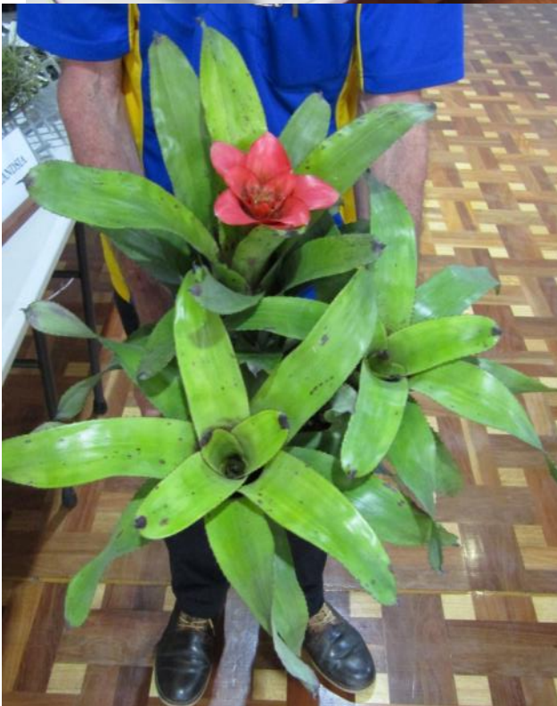
Second Steve Flood Canistrum fosteriana Big Moma 7 Votes