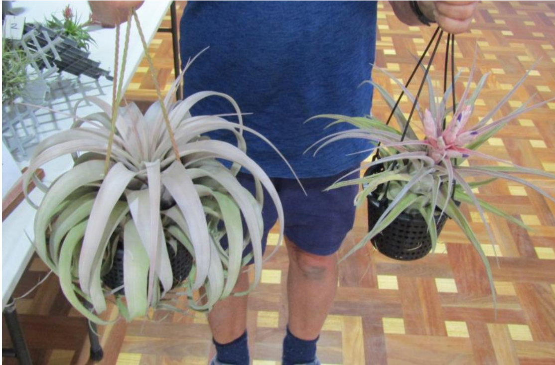
First and Second Greg Jones (left) xerographica - 9 Votes (right) Lucille - 7 Votes