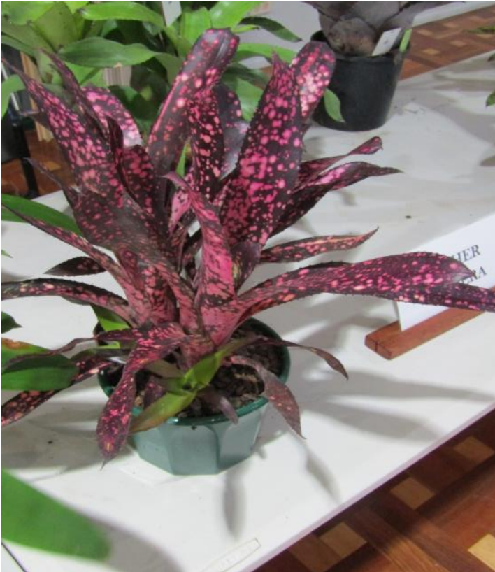
First Chery Basic Billbergia Wild Cherry 17 Votes