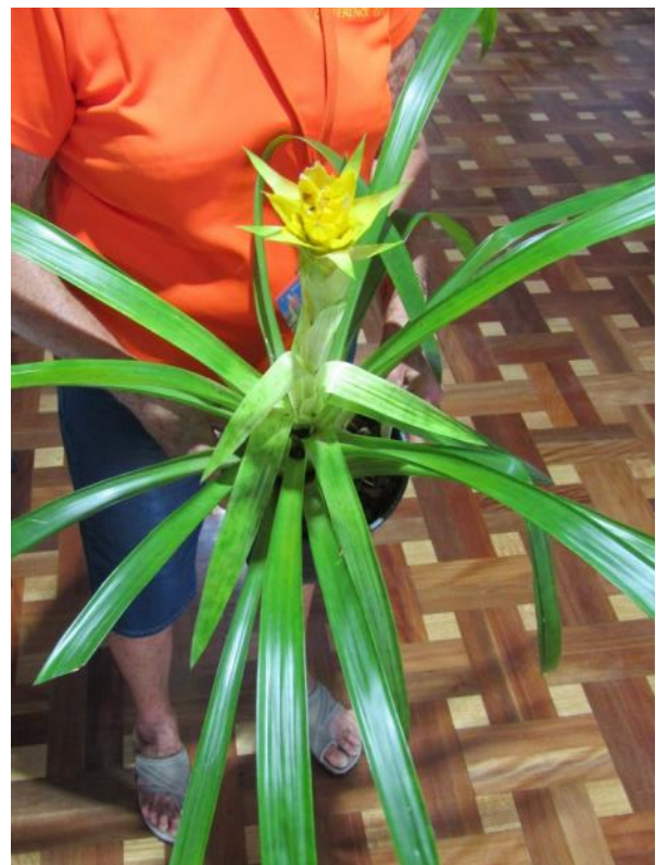
3rd - Jill Cheyne - 3 Votes Puna Gold