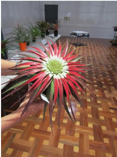
First - Cheryl Basic - 18 Votes Sincorea albopictum