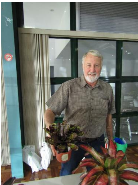
Left - Second Stan Walkley Neo Savoy Truffle 4 Votes