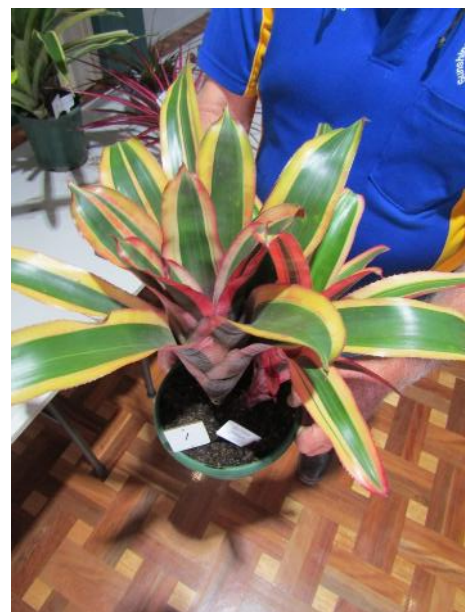
Third - Doug Cross - 6 Votes Billbergia Booyang Lad