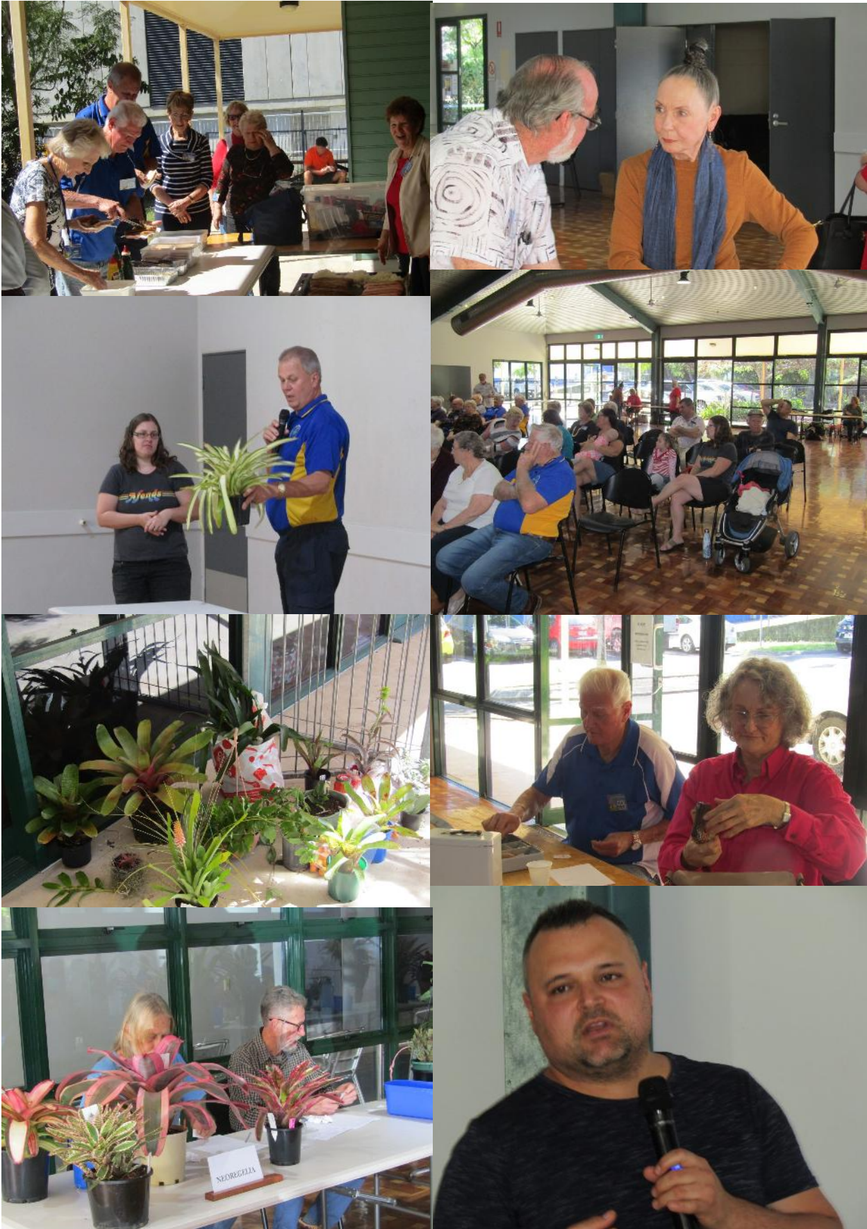
Photo montage of August meeting at Millwell Road Community Centre