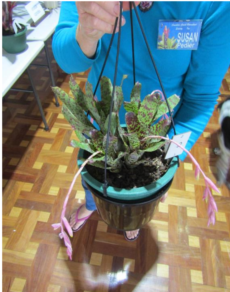
First - Sue Pedlar - 19 Votes Vr. guttata