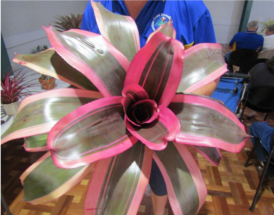
First - Nigel Thomson - 14 Votes Baby Skotak