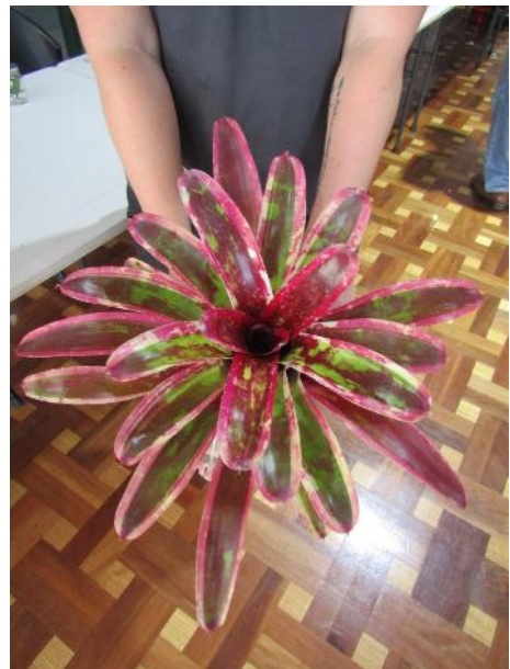
Third - Megan McKerrell - 5 Votes Predatoress