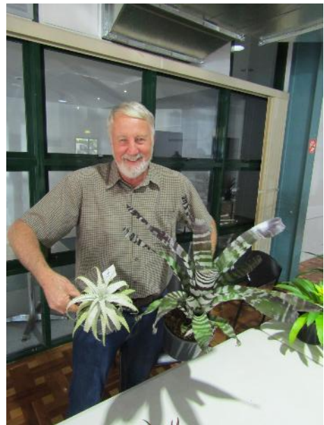
Third & Second - Stan Walkley Cryptanthus warasii 1 Vote Aechmea Chantinii (widebands) 13 Votes