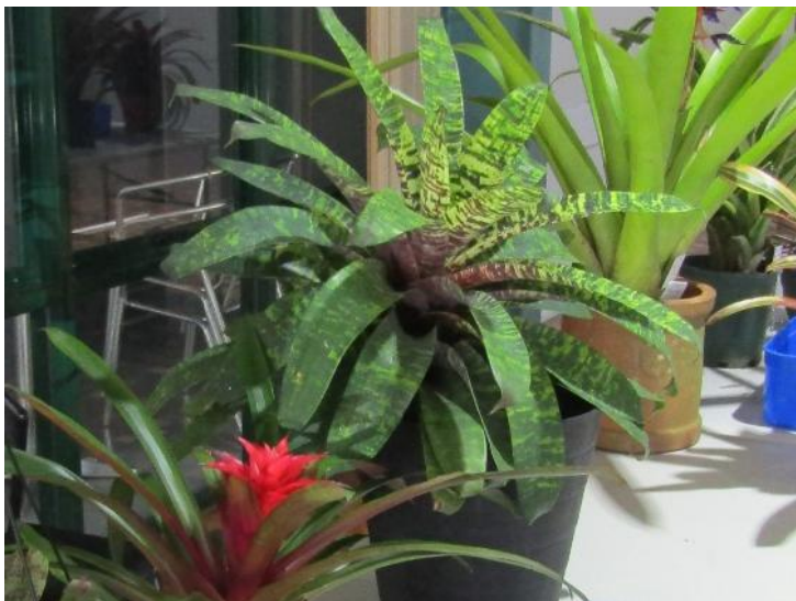
Second - Fay Paku - 14 Votes Goudaea guberii