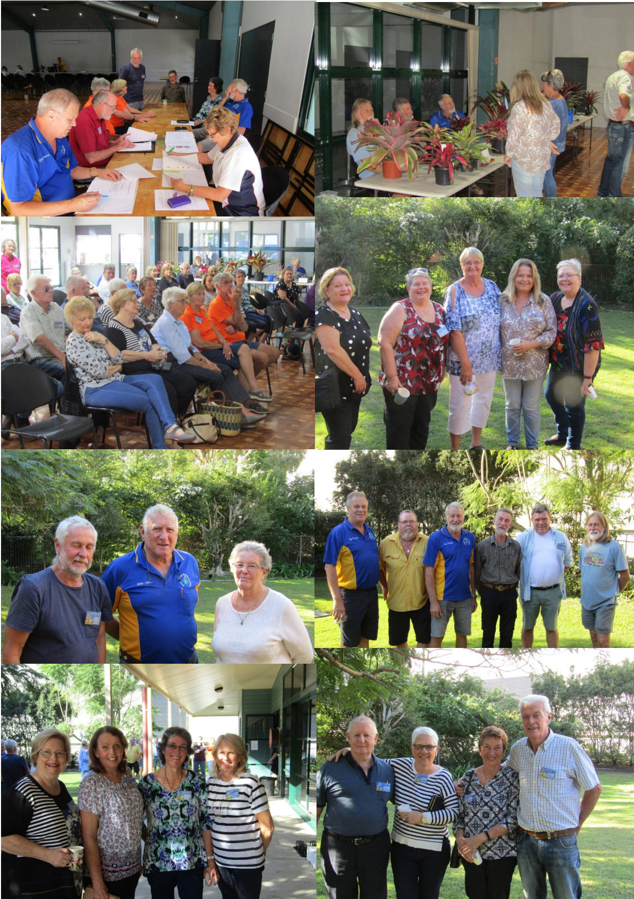
Top left - Committee meeting in progress. Top right - Interest shown at the Popular Choice table. Plenty of happy faces at our June meeting