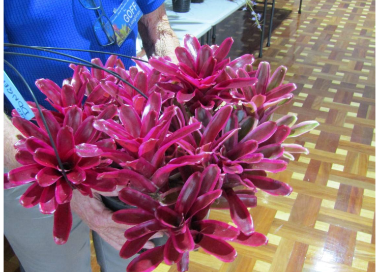
Second Goff & Sue Loughran Mini Donger - 8 Votes