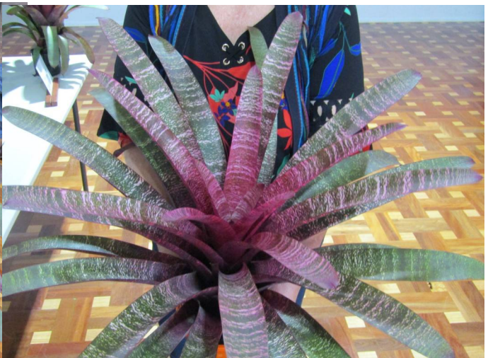
Equal First - Stan Walkley and Sue Murray 13 Votes Vr. Ultraviolet (left) - Vr. Hybrid (Right)