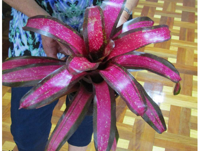
First - Sue Pedlar Absolutley Fabulous- 10 Votes