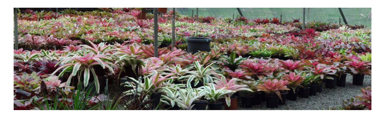
April 20th cancelled meeting at Cheryl Basic's residence Yandina