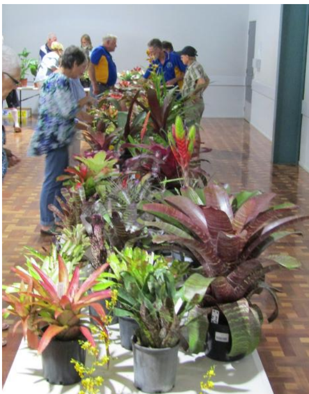
A great collection of assorted Bromeliads