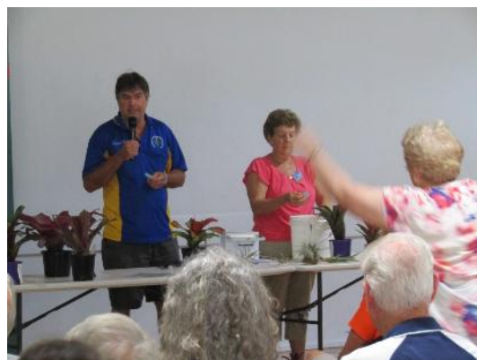
Yes we have a winner