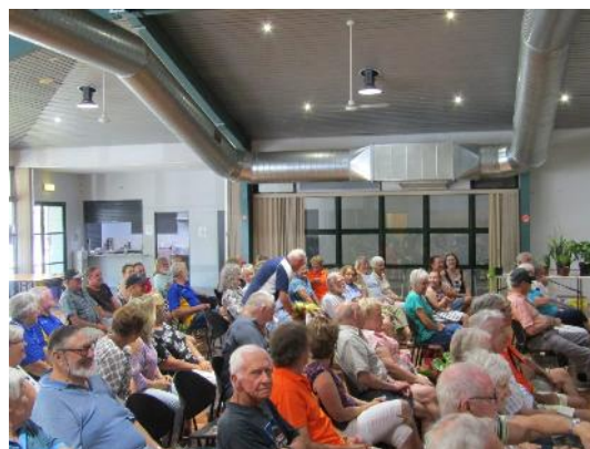
A captive audience all holding tickets