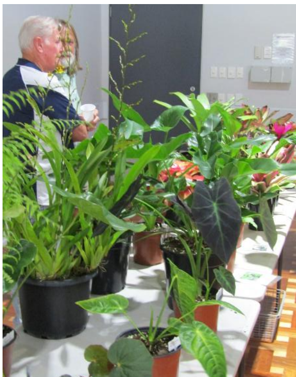
Monster Raffle Plants on display