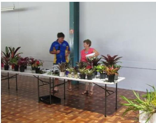
The raffle has commenced