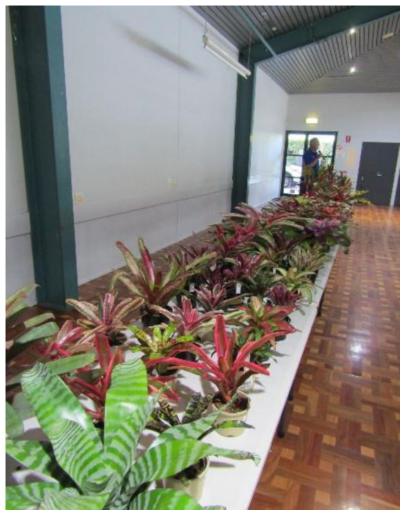
Lots to choice from once the Raffle is drawn