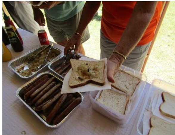
Nothing like a good feed of sausages and onions