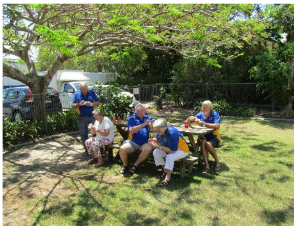
Garden bench gets plenty of use by our members