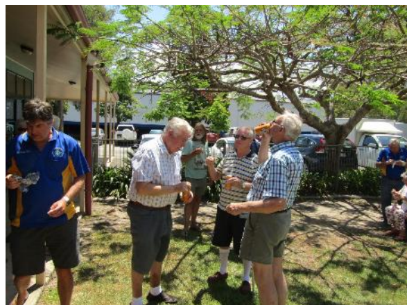
Always something to talk about