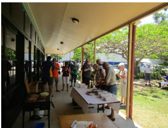
BBQ proving to be very popular