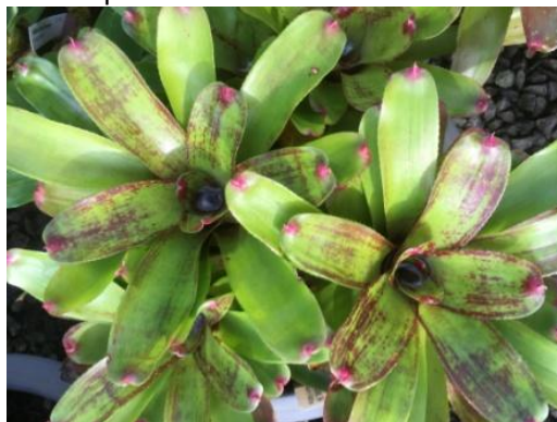
Neo Rise & Shine